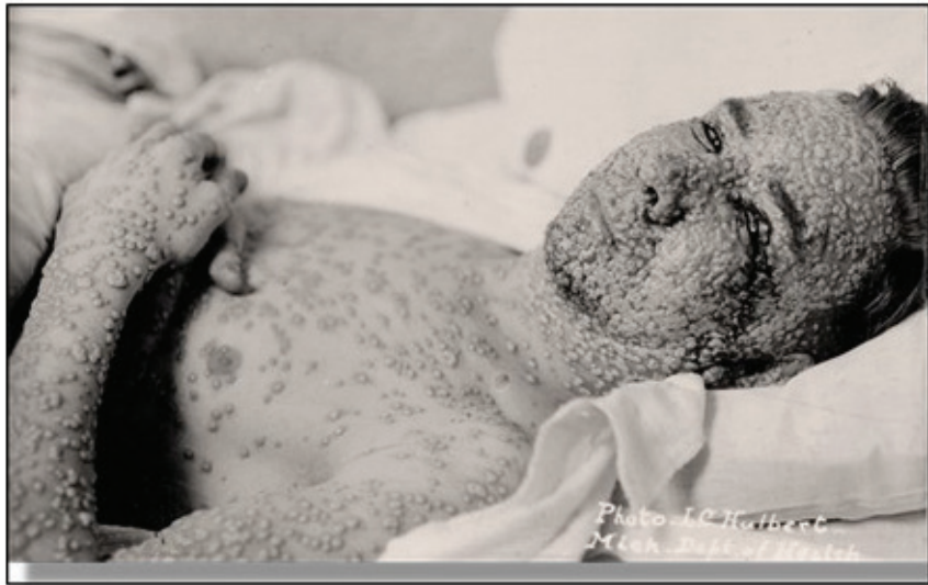
Smallpox victim

“A typical Pest House would have had many beds and often more makeshift beds on the floor. Beds may have been separated with temporary curtains. Men, women and children would all be taken care of in the same building. The single caretaker would have been someone who liked to care for people and was immune to smallpox either having survived it or having had cow pox. Doctors, when available, would check on patients and order medicine. The caretaker would keep patients warm, fed, and comfortable sometimes with help from community members who would leave cut wood and food on the rock outside the door to help out ... there was no running water in the Pest House. Caregivers had to haul water into the Pest House from an outside well, even in the winter. Then the water would need to be heated with a wood stove requiring wood and constant attention to keep it going to keep the building warm and keep water warm to care for the patients.”