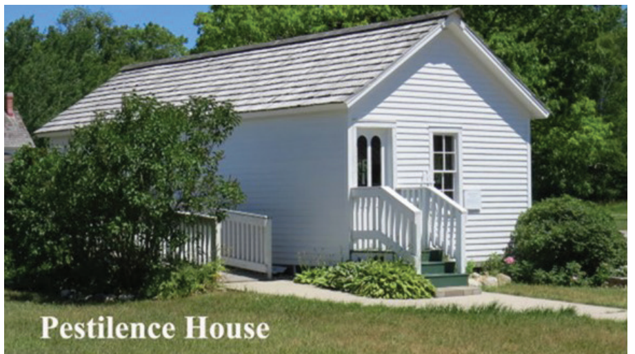
Mackinaw City “pest house,”

people arriving at the port of Philadelphia and was known as the Pest House or the Old Lazaretto.