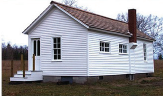
Mackinaw City "Pest House," photo from Mackinaw City Historical Society