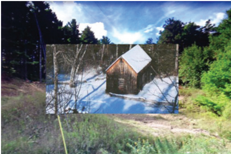
Author's simulation of the 1903 Petoskey pest house located south of the city on Clarion (River) Road

ing a view of the road, and the rail-road tracks beyond ... the residence possesses all the ordinary facility for a properly moderate living apartment. The exterior of the building is pine shingled, while the interior is finished