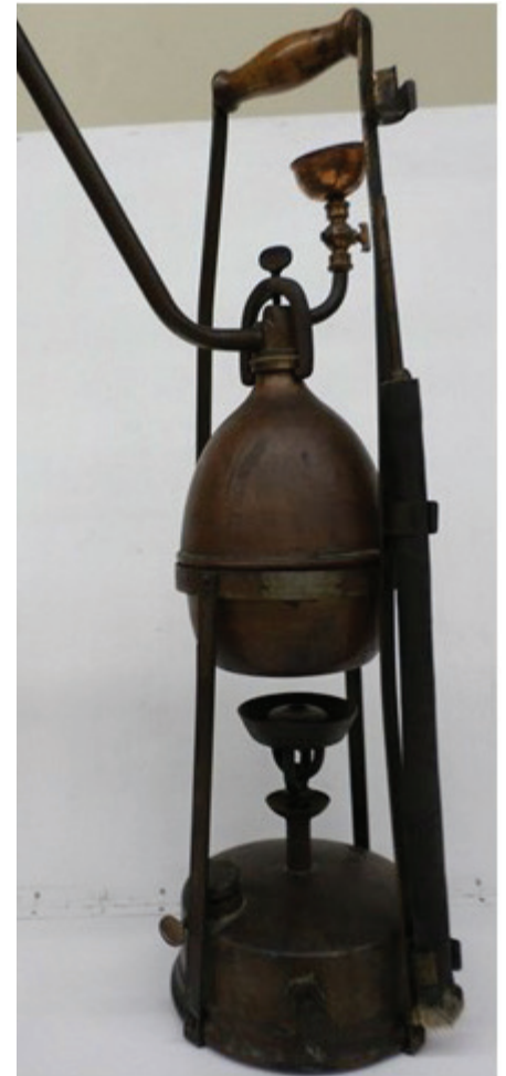
Mocher formaldehyde gas disinfecting generator

its pest house and town dump was owned by Joseph Omlor. He farmed the land, as well as nearby parcels. It contained several outbuildings and sheds. A gully road led to the back of the property which became the town dump until it closed in the 1970s.