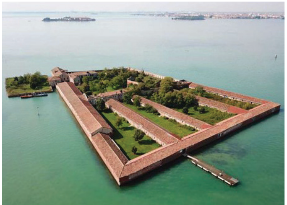
Lazzaretto Vecchi Island in the central part of the Venice Lagoon, 1425

Colonial Philadelphia was the first North American community to enact a quarantine law. It did so in 1700, one year after a yellow fever outbreak killed over 200 of its citizens. The law regulated ships coming into the harbor, requiring them to stay one mile away until the captain could obtain a bill of health license indicating no sickness or disease was on board. By 1743, the city had its own version of the Venice Lazzaretti Island “pest house” or hospital. The 340-acre Fisher’s Island in the Delaware River had a quarantine hospital erected on it. The building was used by sick