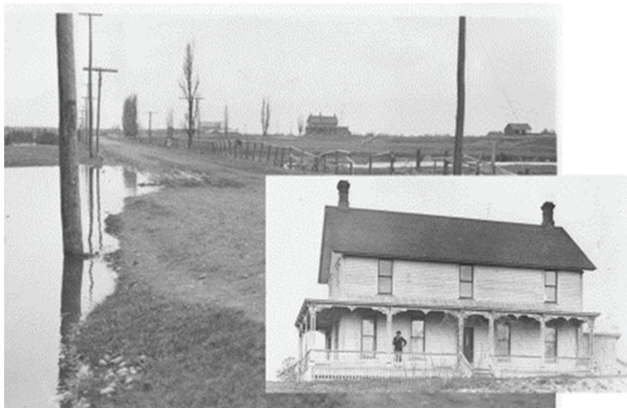
Alpena Detention Hospital

Besides Mackinaw City, Petoskey and Cheboygan, East Jordan and Boyne City had a pest house. Also, Pellston, Levering, and McKinley-Maple River Townships in Emmet County set aside a building for those with com-