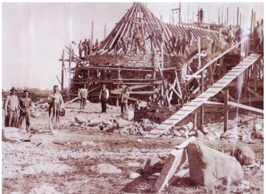
Construction of Loeb Farms in 1918.