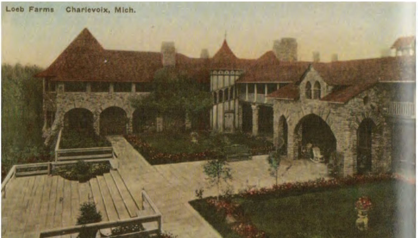
Loeb Farms Charlevoix, Mich.