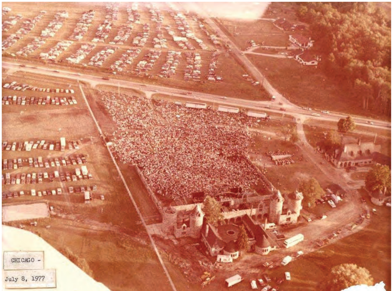
The Record-Eagle, Traverse City, Mich. 49684