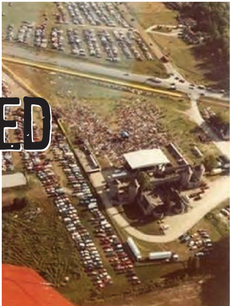
Castle Farms music theatre.