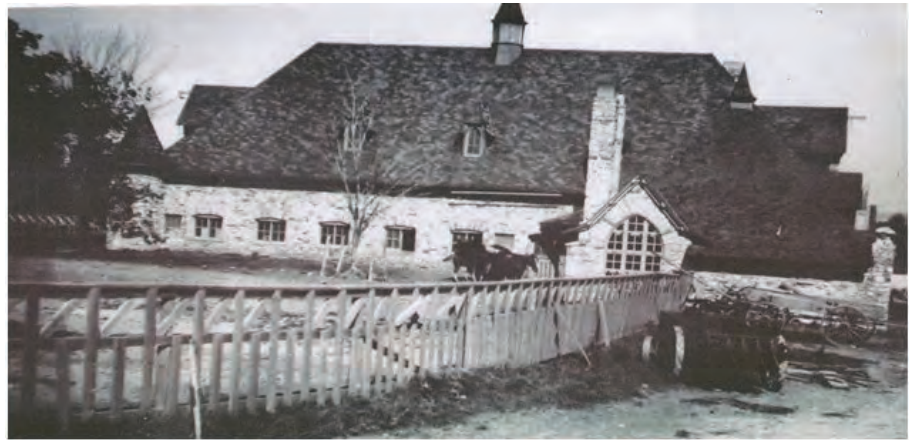
Loeb Farms horse barn in the 1920s.