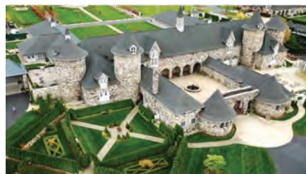
Castle Farms, 2014.