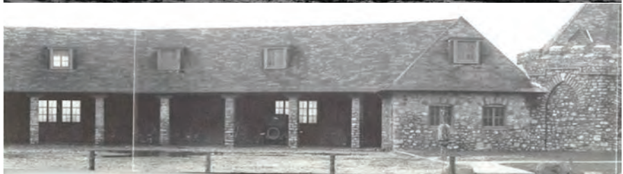
The Carriage Hall was originally an open air structure that housed buggies and automobiles during the days of Loeb Farms.