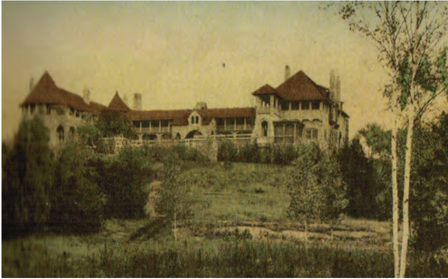
The "Big House" on the bluff of Pine Lake.

main barn, and two massive stone wings extending both in an eastern and western direction. The structures were built along the highway leading from Charlevoix south to Ironton and on to East Jordan. Loeb Farms was open to the public that summer of 1919 as the Midwest "showcase for modern technological farming." Soon, the complex was producing dairy cows and hogs.