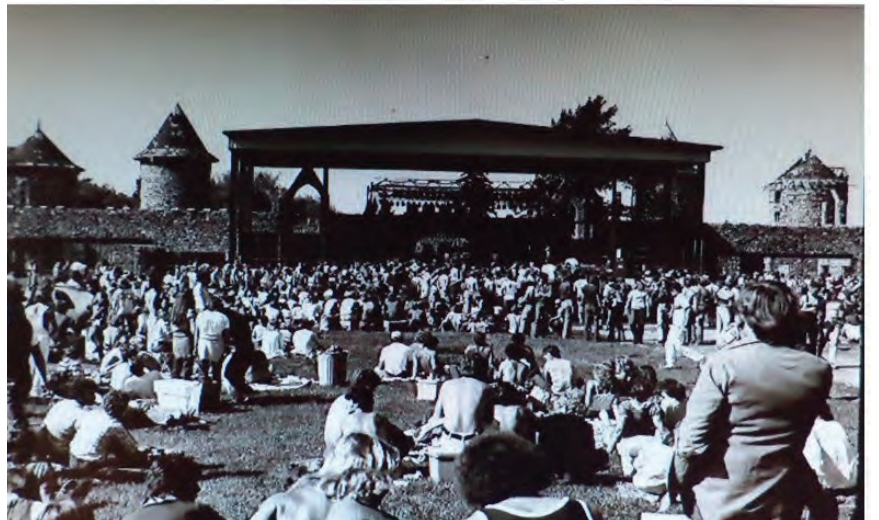
Castle Farms 1980s